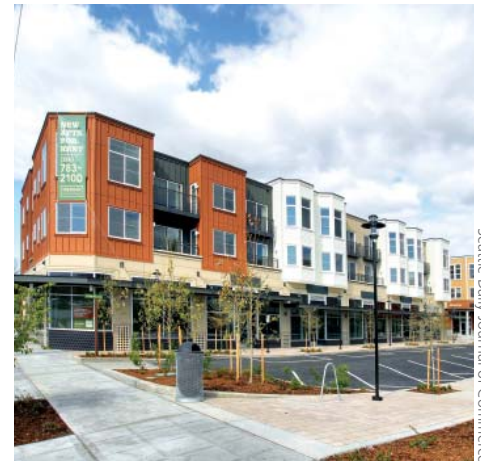
Seattle Daily Journal of Commerce

Details, illustrations and the complete regulation online: tinyurl.com/smartgrowthoverlay